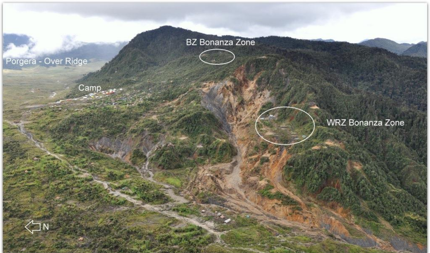
Figure 2: View of the Mt Kare bonanza/high grade zones that are the focus of ongoing evaluation